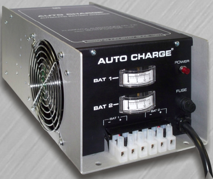
MODEL # 091-145HO-12

The Auto Charge Dual HO, 12 volt, 40amp charger is designed for maintaining the batteries of a 24 volt vehicle that has parasitic 12 volt loads. This excess 12 volt load discharges one battery more than the other and usually overcharges one battery and undercharges the other. The Model 091-145HO-12, Auto Charge Dual HO, contains 2 separate and electrically isolated 12 volt chargers. The chargers may be connected in series and wired to the batteries as illustrated in the wiring diagram in the instruction manual. Each battery is individually sensed and charged. Thus if the lower battery requires more charge, it will continue to receive current after the upper battery has stopped charging. When the batteries are fully charged all charging stops.